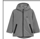
Any lightweight rain jacket