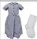
Summer dress Stevensons