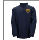
Quarter zip mid layer Stevensons