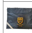
RH Book bag School Office