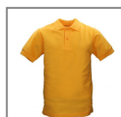
Gold polo shirt Stevensons