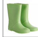
Wellies Any colour