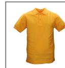
Gold polo shirt Stevensons