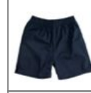
Navy cotton shorts