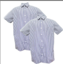
Navy & white stripe short-sleeve, Classic collar Stevensons (Trouser/ Short uniform)