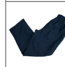
Navy tracksuit trousers Stevensons