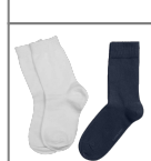
Navy or white ankle socks

Plain trainers, white or black (velcro fastening)