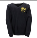
Navy jumper Stevensons