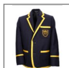
Blazer (everyday) Stevensons