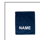
Named navy cotton shoe bag Stevensons

This bag is for spare clothes to be kept at school; inc underwear, shorts or joggers and socks. Also a packet of tissues and a hair brush.