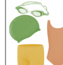
Any swimming costume Any swimming hat Any goggles