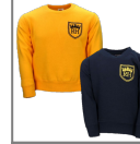
Gold or Navy branded sweatshirt Stevensons