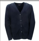
Navy cardigan Optional Item for summer Stevensons