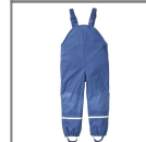
Waterproof dungarees Any colour, for Forest School/ Outdoor Learning