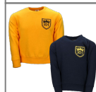
Gold or Navy branded sweatshirt Stevensons