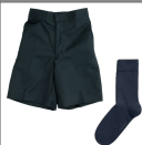
Navy polycotton shorts Stevensons Navy ankle socks