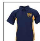
Navy polo Stevensons