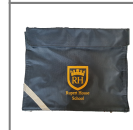
RH Book bag School Office