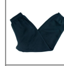
Navy joggers Stevensons