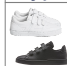
Extra set of trainers at school Plain trainers white or black (velcro fastening)