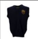
Navy slipover Stevensons (Trouser/ Short uniform)

Black or navy shoes, velcro fastening (not patent)