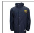
Rupert House coat Stevensons