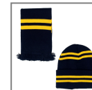
Winter hat/ scarf Optional Items Stevensons