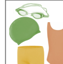
Any swimming costume Any swimming hat Any goggles