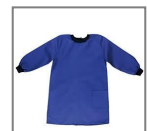
Royal blue art smock Stevensons