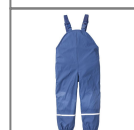
Waterproof dungarees Any colour, for Forest School/ Outdoor Learning