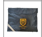
RH Book bag School Office