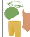
Any swimming costume Any swimming hat Any goggles