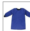
Royal blue art smock Stevensons